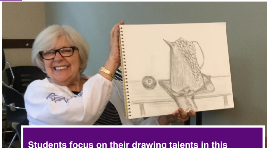
Students focus on their drawing talents in this artistic class.