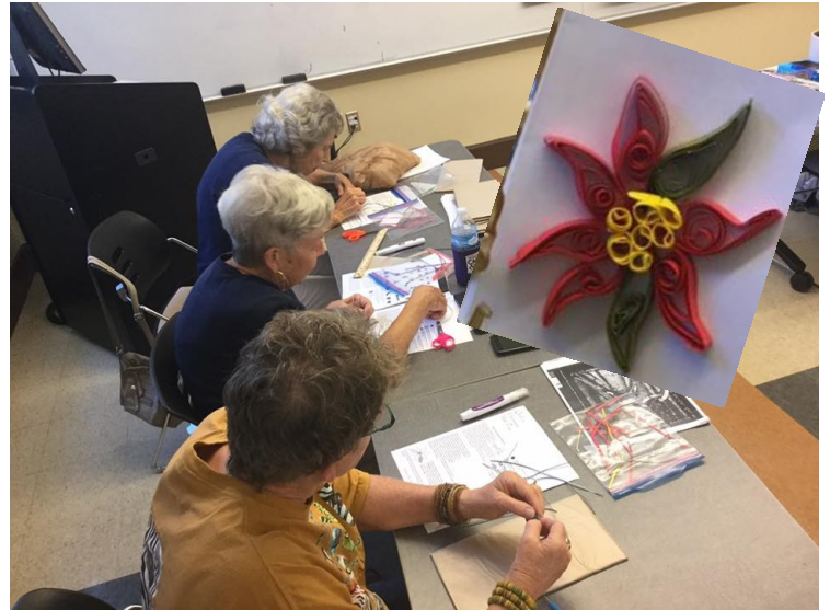
Paper transformed into art. Members learn to quill.