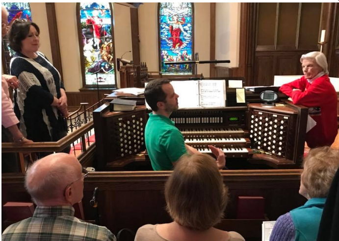
The Pipe Organ takes center stage in this course on "The King of Instruments"

Wesleyan College offers so much to our WALL members and to the community at large. Many events on campus are open to the public (most are free of charge).