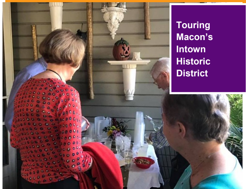
Touring Macon's Intown Historic District