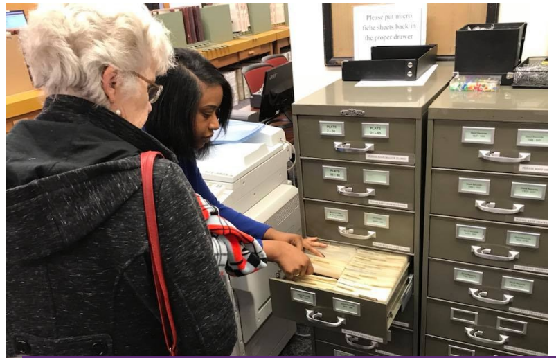
Wall Members get a hands on look at government with a tour of the Bibb County Courthouse