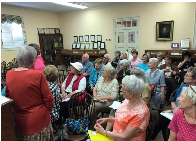
Southern Literature with the works of Eudora Welty and Zora Neale Hurston

Don't forget that Wesleyan art galleries are open Monday-Friday from 1:30 - 5:00 PM and the Wesleyan Market is every Saturday from 10:00 AM – 2:00 PM